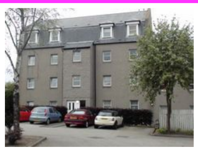
Self-catering rental apartment

111 Littlejohn Street, Aberdeen, AB10 1FL www.ensuitedreams.com/littlejohn/ littlejohn@ensuitedreams.com